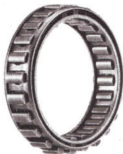
כיוון סיבוב הטבעת החיצונית במבט מכיוון F